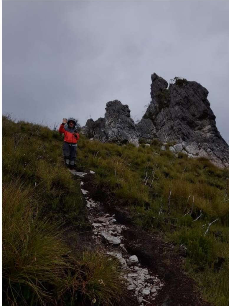
KHALEEL ON THE TRACK WITH A ROCK SPIRE OR NEEDLE LOOMING ABOVE HIM

Up above us we could make out the towering rock spires that obviously had given the mountain its name.