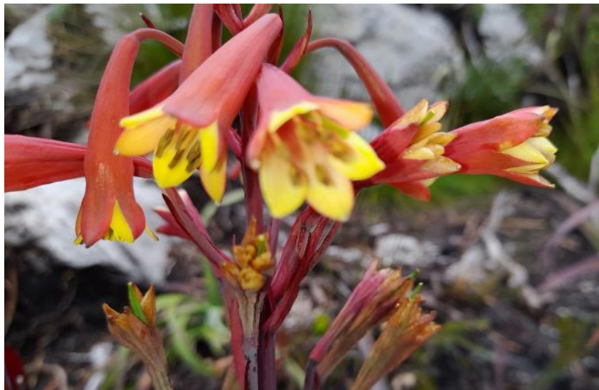
CHRISTMAS BELLS – Blandfordia punicea

Eventually, as we got higher, the regrowth was very stunted and it was very easy to spot the track. The countryside opened out and it was just amazing. The hillside was basically a moonscape with lots of grey skeletons of burnt shrubs; there was also a huge number of wildflowers coming out. It was the most gorgeous display of Christmas Bells and Purple Trigger Plants I have ever seen. There were thousands of them. It was sublime.