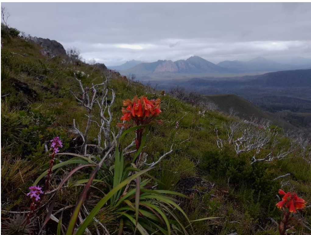
PURPLE TRIGGER PLANTS CHRISTMAS BELLS & THE RANGES OF THE SOUTH WEST

After about an hour we were on the summit and the views were stupendous. It was a dream come true.