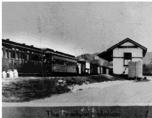
A Steam Train at Dayboro Station Those carriages were still in use in 1980.

Dayboro's Crown Hotel is a classic old Queensland pub, established 1913. It's easily recognisable on the left-hand side of the road as you arrive in Dayboro from Samford, just at the point where Route 22 turns sharp right and heads to Petrie. Two century-old fig trees frame the pub's iconic verandah. We can have our lunch on this famous verandah, inside the pub or out the back in their beautiful beer garden. There's a varied menu prepared by their chef, Nicky, originally from Fiji, who prides himself on his commitment to "source fresh and local produce on a daily basis, supporting our local farmers".