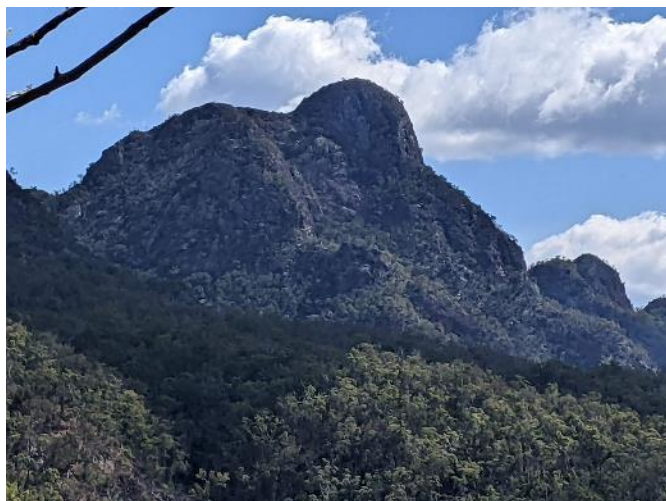
Mt Barney Eastern Side From Yellowpinch Lookout.